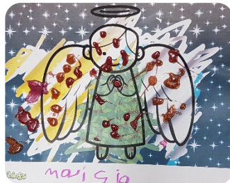
By Maisie age 5