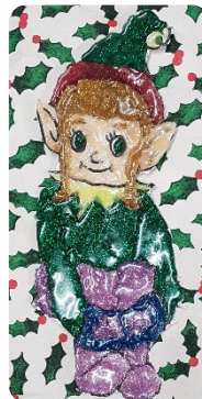
By Gia age 7